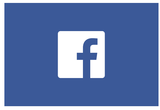
Reversed-out to White

Use this version with a blue box and white "f" on white or light color backgrounds.